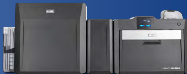
Dual-sided printer/encoder with optional lamination